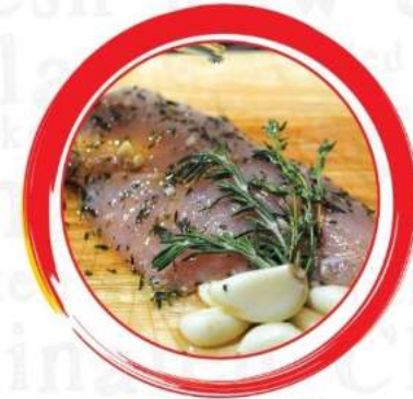
Pre - Marinated Chicken