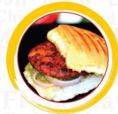
Innovative Snacking Range POW WOW