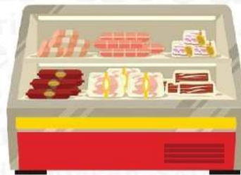
State of the art display & storage equipment