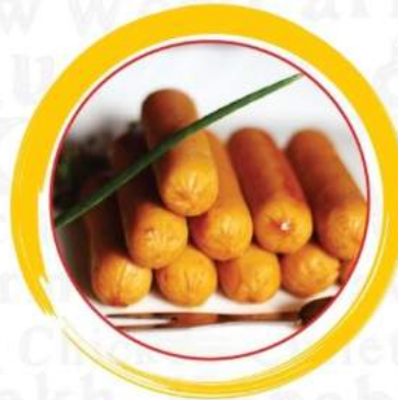
Sausages & Salamis