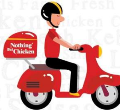
Dedicated delivery partners for top-class customer service