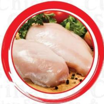
Corn-Fed Fresh Raw Chicken