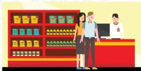
Modernized Retail Set-Up