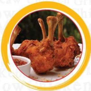
Heat & Eat Chicken Snacks