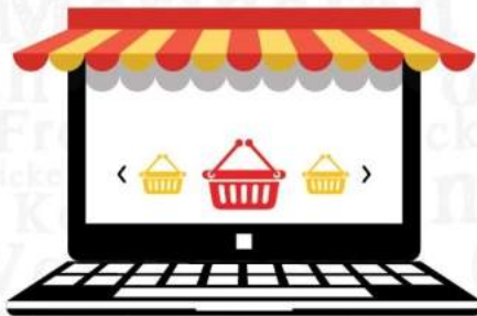
E-Commerce enabled website to cater to online shoppers