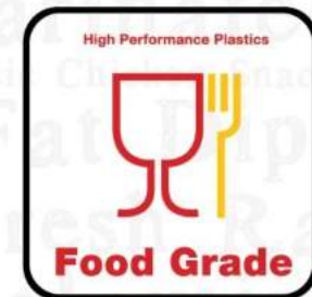
Modern food-grade packaging