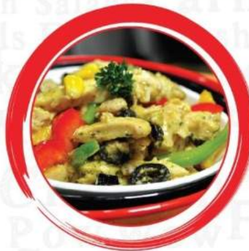
Grilled Chicken Salads